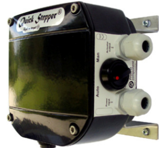
Electric Positioner Remote Feed-Back QS-E2G-LT-LE