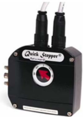
Pneumatic Positioner Internal Feed-Back QS-P2G-BASE-RM