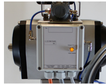
Seal Control Box With power supply and LED indicator