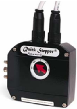
Pneumatic Positioner Internal Feed-Back QS-P2G-BASE-RM