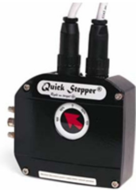
Pneumatic Positioner Internal Feed-Back QS-P2G-LT-RM