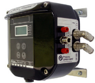
Pneumatic Positioner Local Display & Remote Feed-Back QS-P3G-BASE-RED/LED